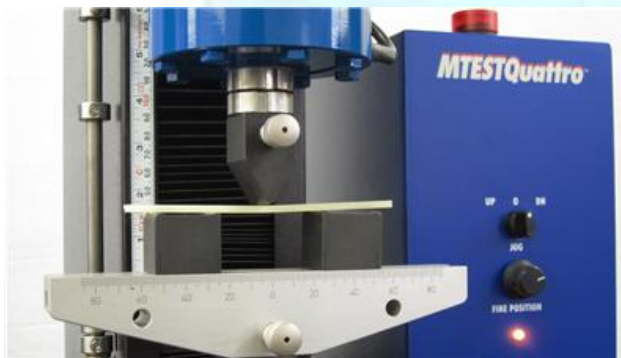
Fig.1: Flexural test setup

Flexural test were carried out on 18 beams, out of that each of 3 beams are tested for hybridization ratio 0-100%, 30-70%, 50-50%, 70-30%, 100-0% (Steel-Polypropylene)[14]. For all hybridization ratio fiber volume 0.5% by volume of concrete is kept constant.